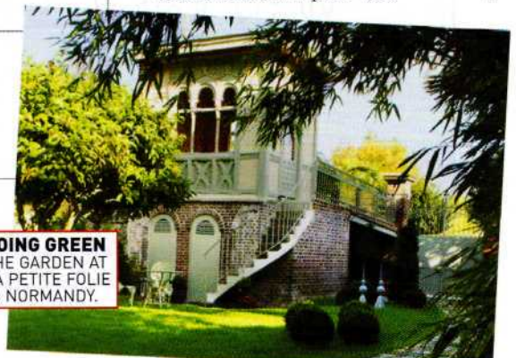
From top: Courtesy of Chic Retreats; Courtesy of La Petite Folie.

GOING GREEN THE GARDEN AT LA PETITE FOLIE IN NORMANDY.